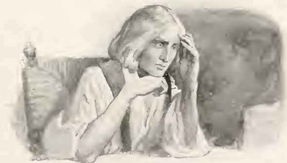
Peter tapped his forehead with his fingers. (P. 227.)

He awoke as the first streaks of dawn appeared and sat up, placed his elbows on the table and rested his head upon his hands. As he remembered the whispering in his ears he said to himself: "Rhyme foolish Charcoal Peter, for goodness sake make a rhyme." He tapped his forehead with his fingers, but no rhyme would come, and as he sat there sad and disturbed in his mind, trying hard to find a rhyme to "grow," the young fellows passed the cottage and one of them was singing at the top of his voice: